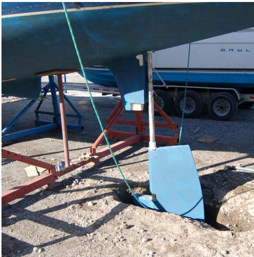
The rudder had to be removed for repair. The bottom 6 inches were torn off by the rocks, but the boat sailed all the way to port despite the damage.